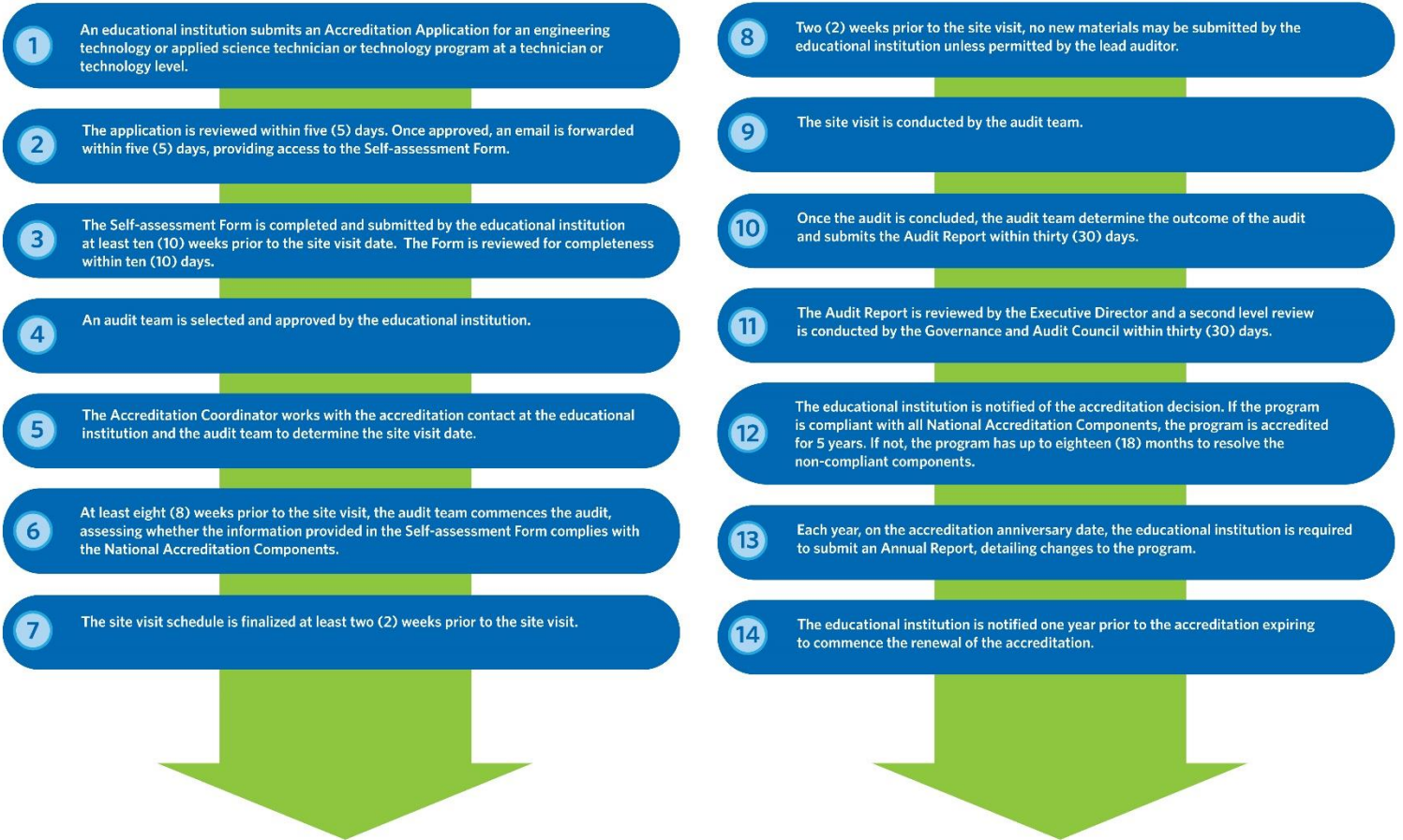
Accreditation Process Chart

The National Program Accreditation process for a standard accreditation is outlined in the following sections. Unique steps in the process for other categories of accreditations are detailed in sections 3.9 and 3.10.